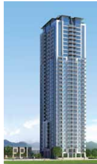
Ultra, Surrey, BC

WestStone Properties is part of the WestStone Group of companies which, with over three decades of experience in real estate construction and development, boasts award winning projects in British Columbia, Alberta and Arizona.