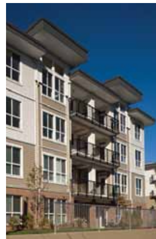
Sonnet, Langley, BC

From top quality trades people to highly experienced customer service specialists, the WestStone team is committed to creating exceptional homes and delivering outstanding service. As part of the WestStone family of homeowners, you are cared for every step of the way.